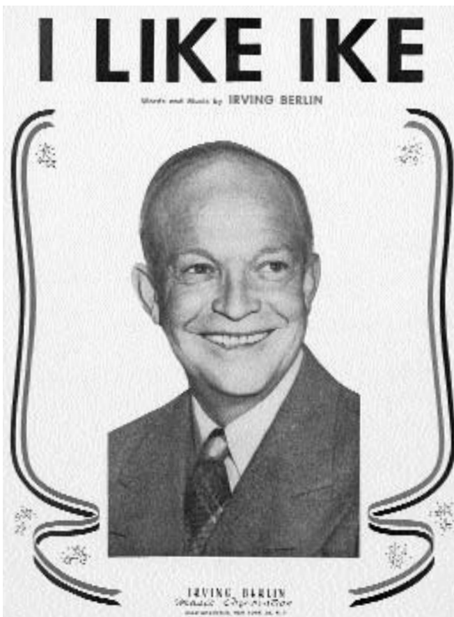
Sheet music cover for Irving Berlin’s song “I Like Ike.” Written as part of a musical, “I Like Ike” quickly became the Eisenhower campaign song. An Ike supporter himself, Berlin captured the public sentiment in his lyrics: “He can lead us all as he led the boys.”

On the stump, Adams used every argument for Ike he could conjure. His remarks at campaign rallies emphasized, for example, the “frugality” that Ike had grown up with and would assuredly practice in the White House. But he also talked about the dangers of Soviet Communism and the need to elect a president wholeheartedly committed to defense of western European democracy. Aware that his candidate was not in New Hampshire stumping for votes, Adams attempted to turn a liability into a virtue. Asked in a debate, “where does Eisenhower stand [on the issues of the day]?” Adams adroitly parried, “He stands side by side with your absent sons . . . On the Rhine or fighting on Korea’s heartbreak hill. . . . He stands between you and communism. He stands for all we hold precious in our hearts—freedom, decency, and faith in a new day for America and for all the world.” Above all, Adams hit hard on Taft’s vulnerabilities as a candidate, his lack of appeal to independents, and the need for Republicans to take back the White House—something they could do confidently only with Eisenhower. 44