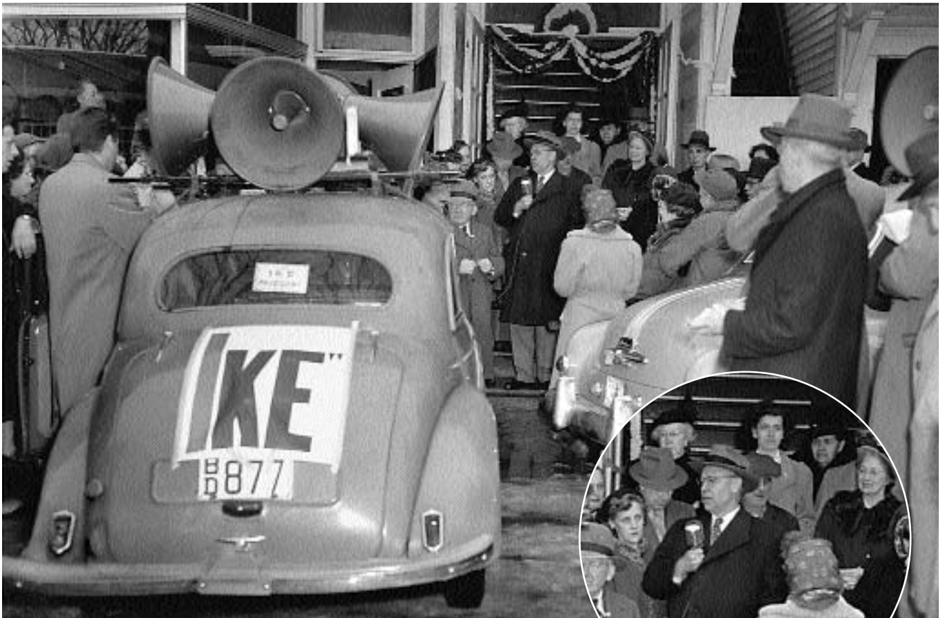
Senator Robert A. Taft speaking at a gathering of potential New Hampshire voters, 1951 or 1952. (A closeup of the surrounding audience suggests the serious nature of Taft's comments, in contrast to the lighter tone of the Eisenhower rallies.) Although Taft was not the most personable candidate, he did attempt to meet the voters face to face. By contrast, Eisenhower's campaign was conducted from afar and by representatives like Governor Adams. Even so, Taft had trouble competing with the popular general, as the sign on the automobile in the foreground suggests.

his favor. Taft's seeming momentum impressed even James Reston, the pro-Eisenhower political analyst for the New York Times , who visited what he called this "politics crazy" state late in the campaign to take its measure. Taft, he wrote, was making "progress in a state where General Eisenhower is about as well represented as anywhere in the nation." Moreover, unscientific surveys by various New Hampshire newspapers showed the race tightening, to the point where it could go either way. 49