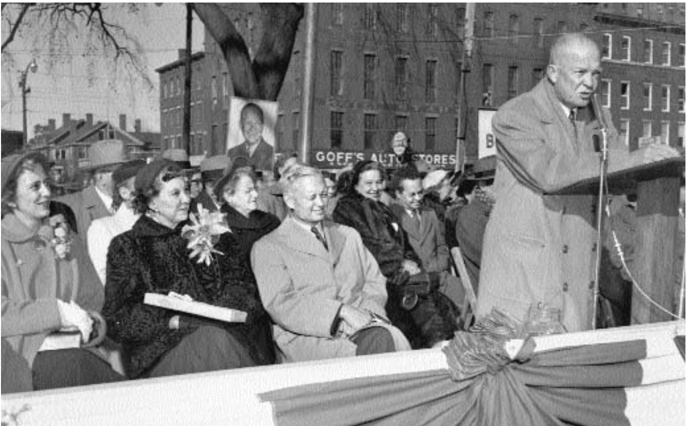
Eisenhower, after returning to this country following his victory in the New Hampshire primary, shown speaking to a crowd of six thousand in Manchester, October 21, 1952. Mamie Eisenhower and Sherman Adams listen as the Republican presidential nominee praises Adams for his service as campaign chief of staff. Following Eisenhower's election that November, Adams served from 1953 to 1958 as Assistant to the President.