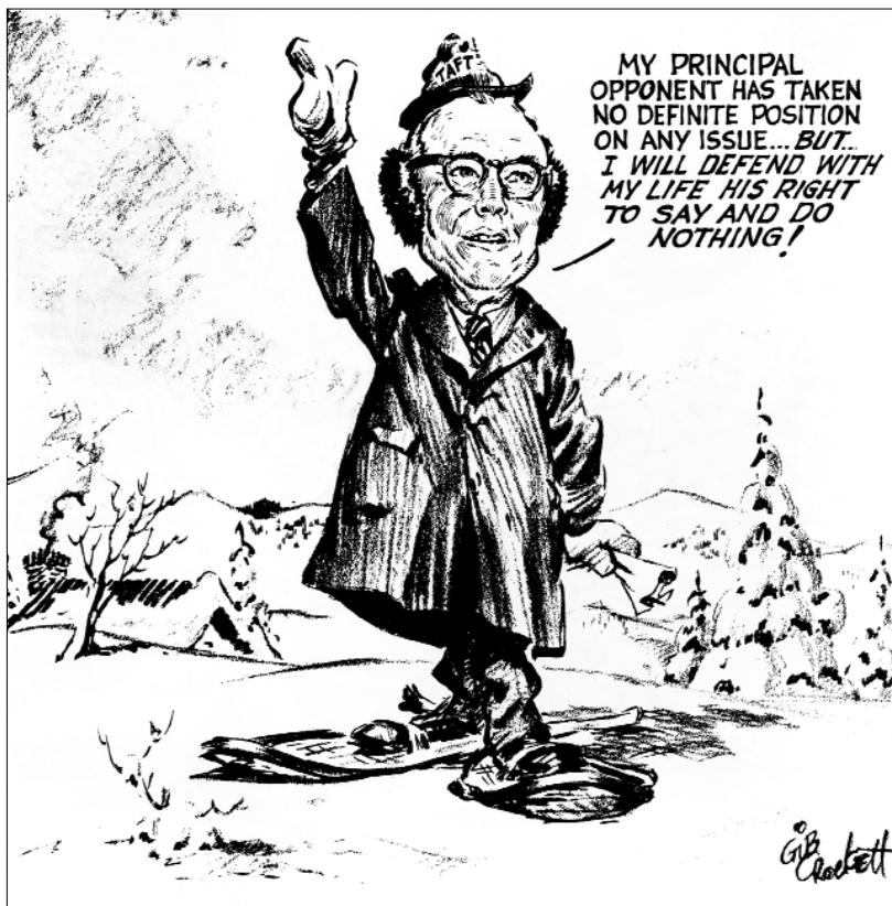
Despite Eisenhower’s popularity, questions repeatedly surfaced concerning where he stood on various issues. If Taft took full advantage of this opportunity, he could stand to benefit from the public’s uncertainty concerning Eisenhower’s political platform.

Nevertheless, as the national press converged on New Hampshire in the final two weeks before the primary, reporters increasingly viewed the result as anything but foreordained. Private polls reassured Adams that Ike was holding onto the lead he had established at the campaign’s outset. 48 Stassen’s personal campaigning in New Hampshire posed little threat to Eisenhower, but no campaign manager could be oblivious to articles in national publications suggesting that the Taft visit might turn the tide in