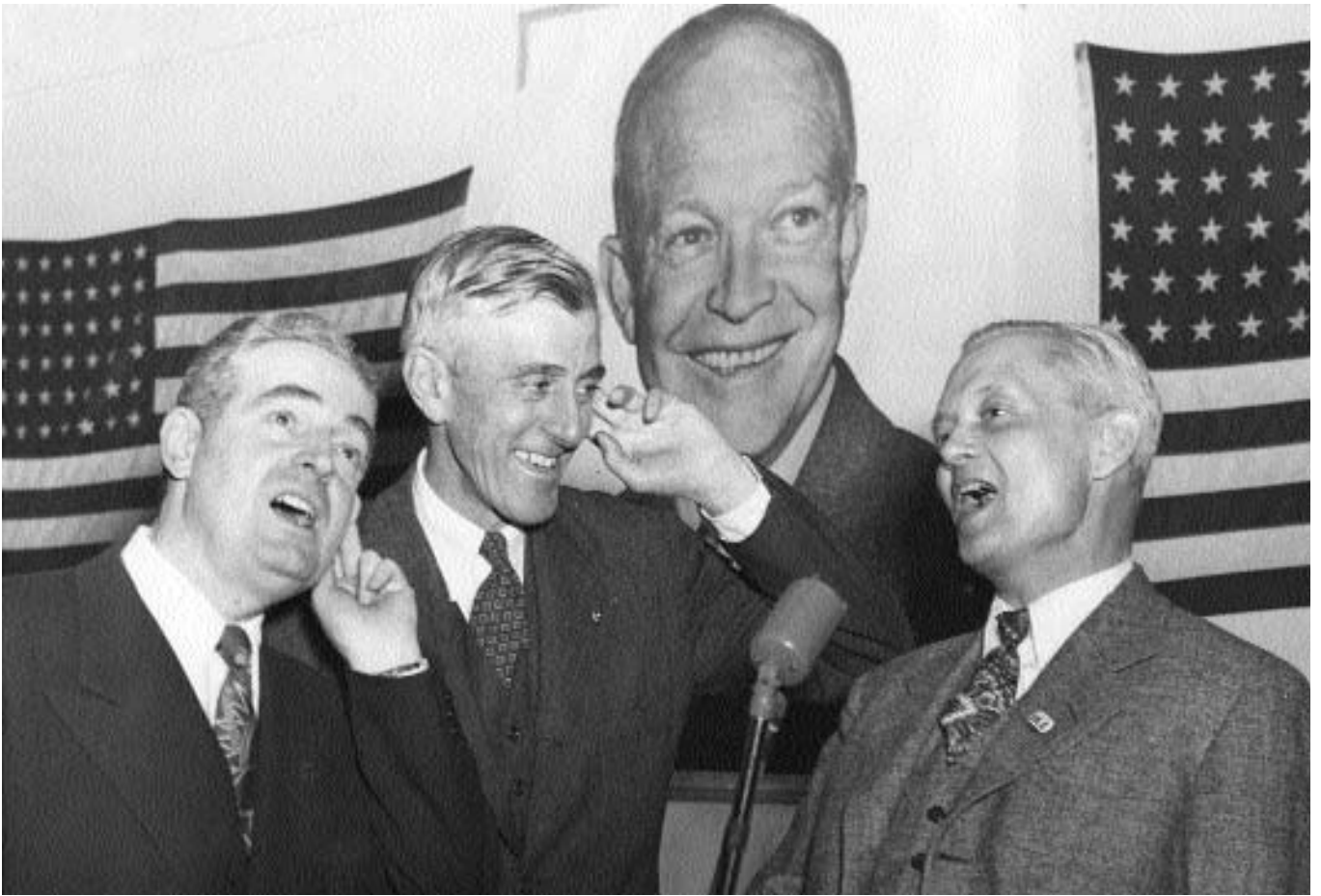
Bandleader Fred Waring, Senator Leverett Saltonstall, and Governor Sherman Adams (left to right), singing the general's praises at an Eisenhower rally in Claremont, March 4, 1952. With Eisenhower still on duty in Europe, his supporters—chief among them Sherman Adams—had to find ways to promote their candidate. Popular swing bands and vaudeville acts helped draw crowds who then joined in singing campaign songs.

were standing in the aisles of the Claremont city Hall, roared their approval. They had come to hear politics leavened with entertainment. . . . Governor Adams gave them just what they were after, a good hard-hitting dose of politics presented in an entertaining fashion.” According to the article, “At every mention of Eisenhower, there was a burst of spontaneous clapping from various sections of the floor which was picked up and carried across the hall like a breaking wave.” 36