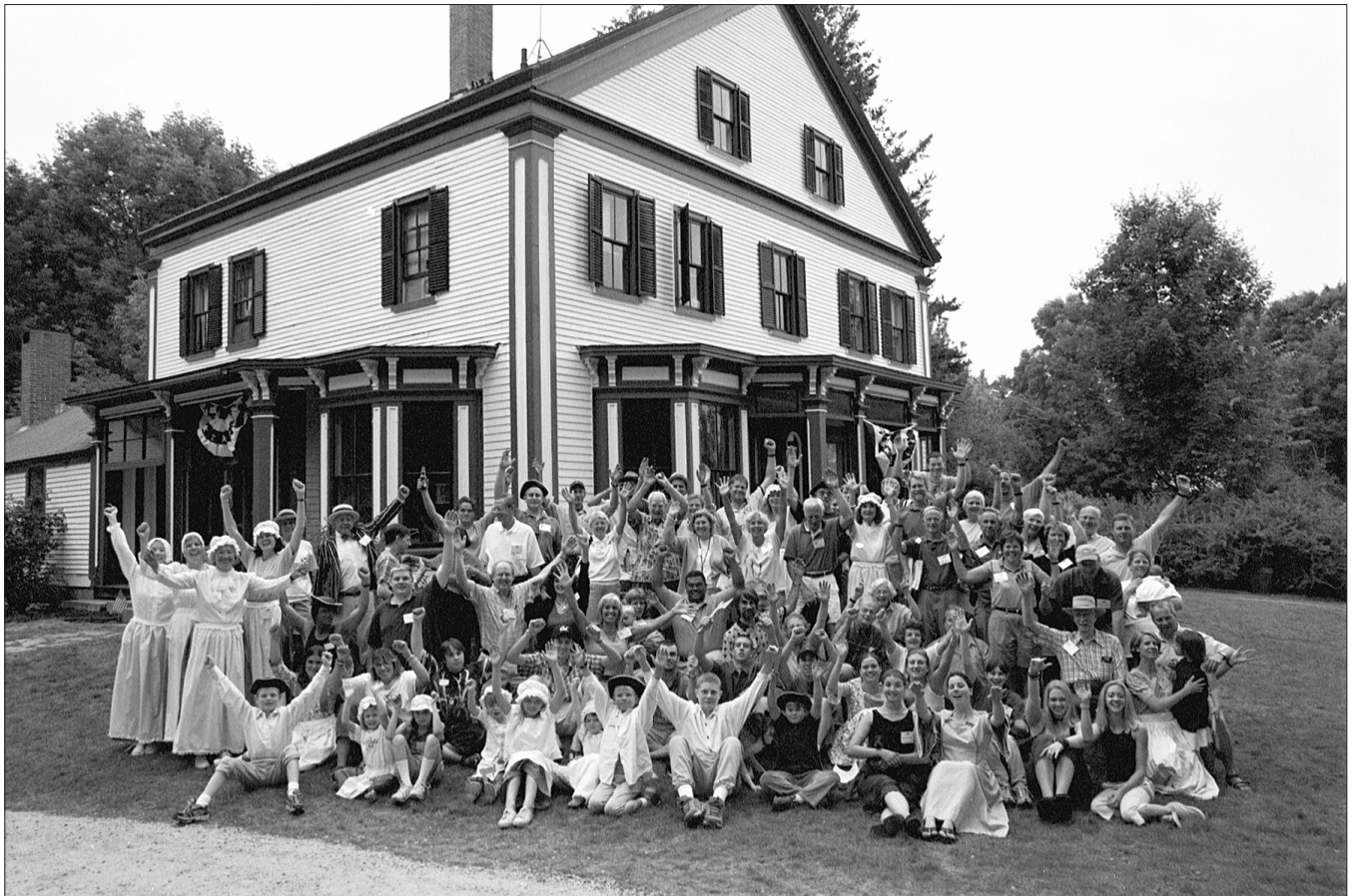
Multiple generations of the interrelated Haley, Burley, Cilley, and Burleigh families, pictured in front of the Benjamin Burley House, gathered for a reunion celebrating 250 years in Epping. Thanks to members of these history-minded families, extensive collections documenting the lives of their ancestors have been entrusted to the New Hampshire Historical Society, where they will be preserved for generations to come. See story on page 1.

The independent nonprofit that saves, preserves, and shares New Hampshire history.