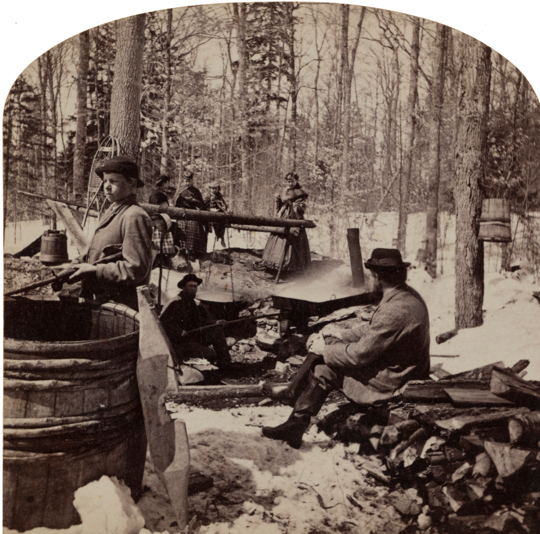
“Boiling sap,” detail from a stereograph by Kilburn Brothers, Littleton, NH, circa 1870, New Hampshire Historical Society. Many consider spring in New Hampshire to be the sweetest time of the year, when the sap of sugar maple trees is running and boiled to make syrup.